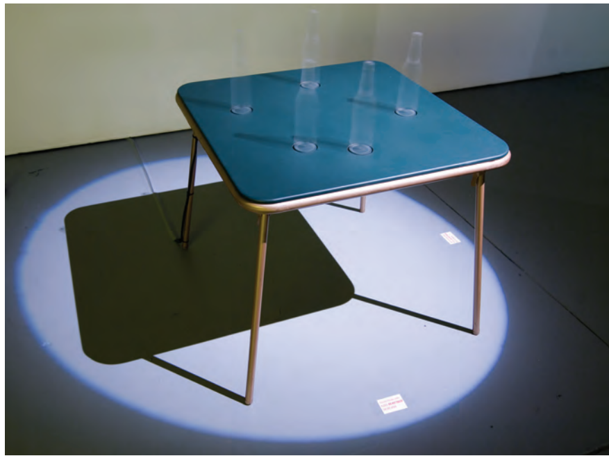
Relative Stranger 4 , mixed media, 30"x37"x30", 2010.

he has no aspirations to be a magician, Mandel does have an overriding interest in dematerialization—de-bulking the physical world or, at the very least, playing with the viewer's perception of its concrete nature.