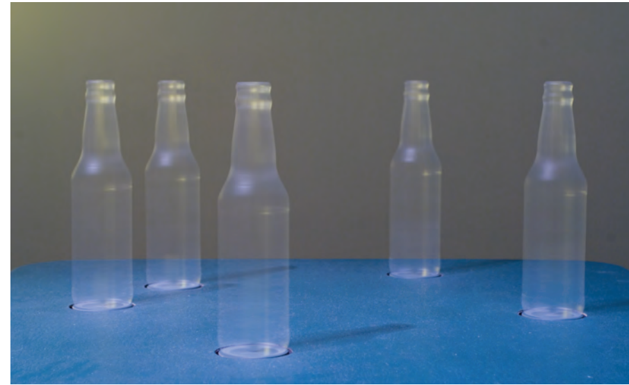
Relative Stranger 4 , mixed media, 30"x37"x30", 2010 (detail).