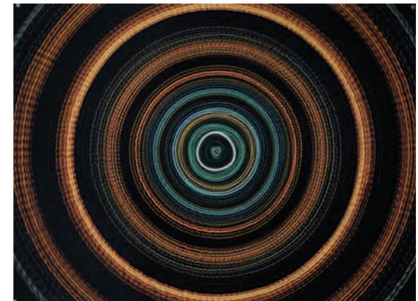
Provincetown Harbor 2/20/2010 12:16am , digital c-print, 24"x18", 2010.

manipulated, then, the key to such defamiliarization must lie in the physical realm. In this instance, he built several rotating and swinging arms to which he attached his camera; setting his shutter speed to 30-second exposures, he was able to capture the blur of light as the camera rotated on a center axis in the winter darkness of northern Cape Cod.